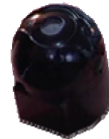
Ai-Ball™ – World’s smallest wireless video camera

In July 2011, we had a successful launch in Japan and embarked on a global tour to promote Flu Card® and Ai-Ball™ software apps. As a leading voice of the technology industry, the US is another important market for us and one that we hope to cultivate. There is no better platform to introduce our latest innovations – the Flu Card® and Ai-Ball™ – to our friends in the US than the International CES.”